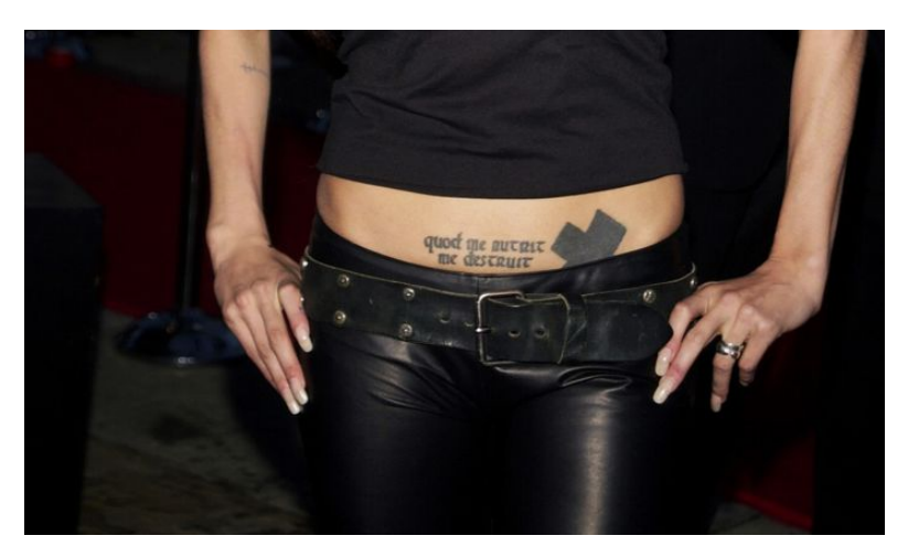
Figure 1: Tattoo of Angelina Jolie, showing the inscription "Quod me nutrit me destruit."