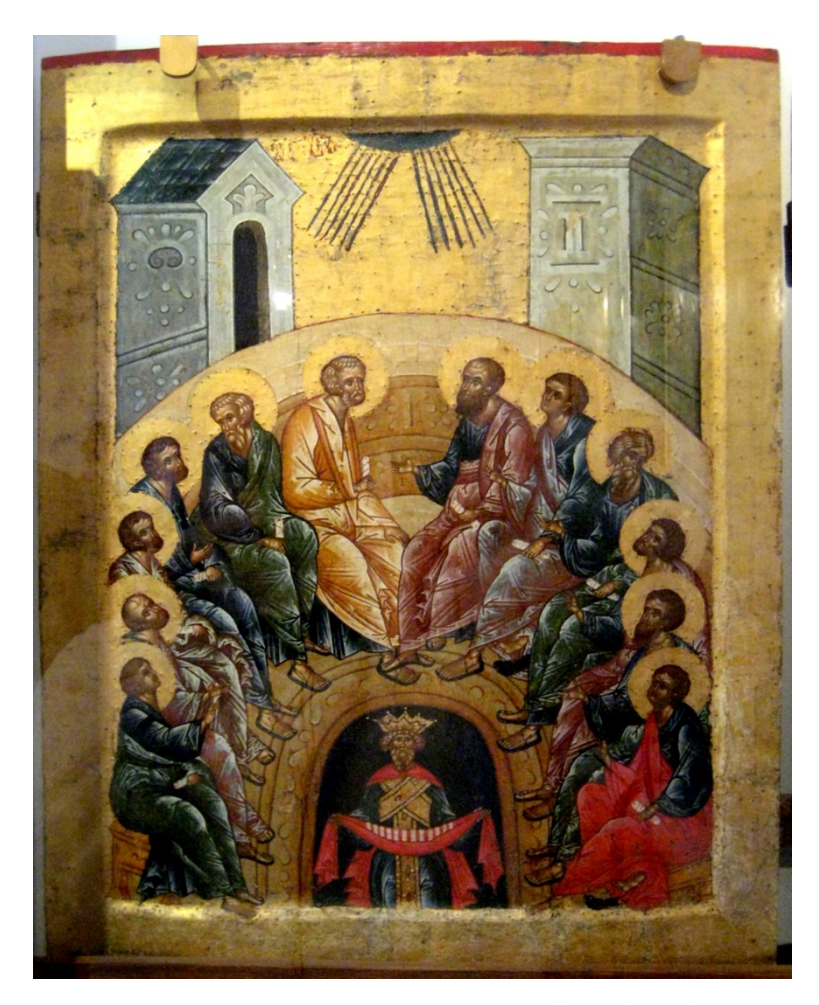
Figure 2: Russian Pentecost icon, c. 1497. Kirillo-Belozersky Monastery. Public domain: <a href="https://commons.wikimedia.org/wiki/File:Pentecost">https://commons.wikimedia.org/wiki/File:Pentecost</a> (Kirillo-Belozersk).jpg.

Ouspensky remarks, because of the liturgical and theological content of the icon, the world's wholeness cannot in this case be sufficiently represented by its parts—the various peoples and nations as mentioned in the Acts — and it is therefore better expressed by an allegory. Since the twelve scrolls that the old man Kosmos holds traditionally represent the coming preaching of the apostles, the many languages of the world, of the enlightened kosmos , are also depicted in the icon.